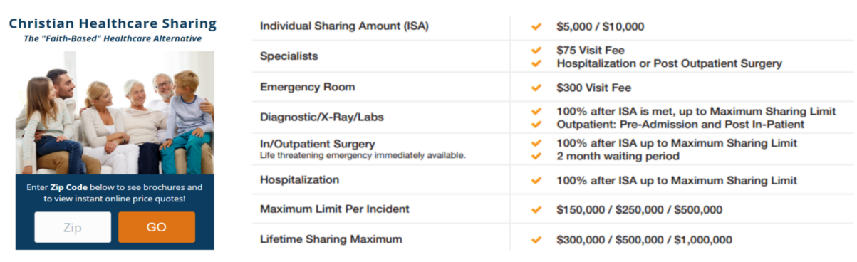
Figure 9: Excerpts from sample health care sharing ministry plan documents

Note: If you join this organization instead of purchasing health insurance, you will be considered uninsured. Whether anyone chooses to assist you with your medical bills will be totally voluntary because no other participant will be compelled by law to contribute toward your medical bills. As such, participation in the organization or a subscription to any of its documents should never be considered to be insurance.